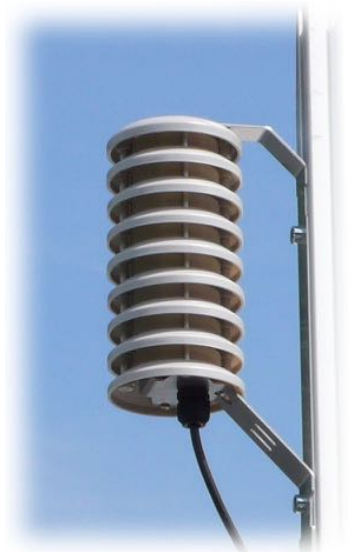
Optional weather protection Shield Tamb-Si